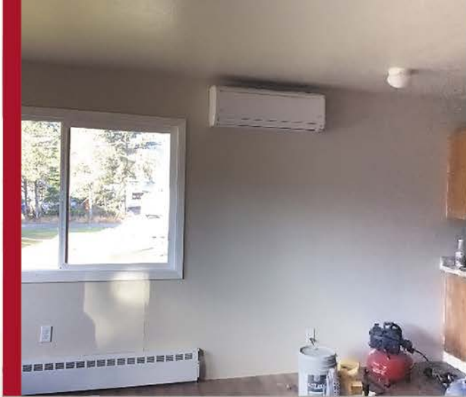
Heat pump-indoor unit