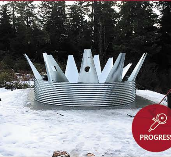
Silo being built in support of alternative energy

The cost of utilities in rural, diesel fueled electric communities can be 275% above the national average. In combating the high costs by finding solutions with alternative energy, solar energy has proven a successful source. Currently, THRHA is installing a biomass pellet fueled heat system to the apartments owned and managed by THRHA. District heat will be provided by three oil boilers and one pellet boiler. THRHA will remove twenty oil boilers and install two oil tanks to replace twenty-two old oil tanks. Hot water tanks will also be installed in each unit. The project will be completed this summer by a local crew and apprentices headed up by Gordon Kookesh, Pacific Rim Mechanical, and Tongass Electric.