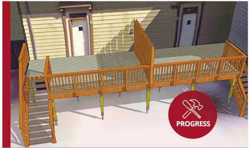
Architects drawing of new deck